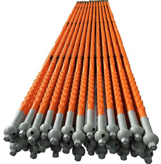
NC-Bolts packed on pallet.