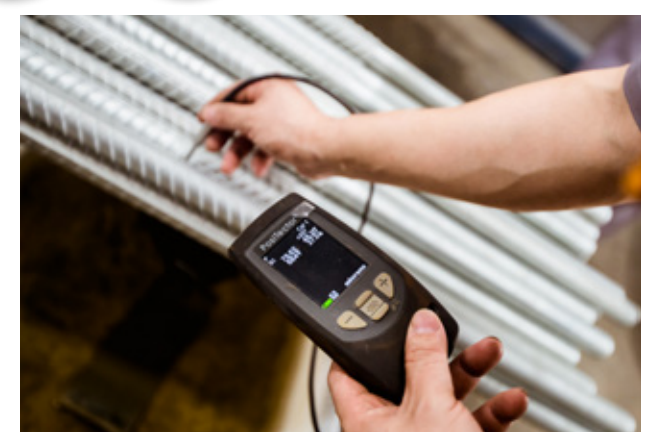
Control of coating thickness